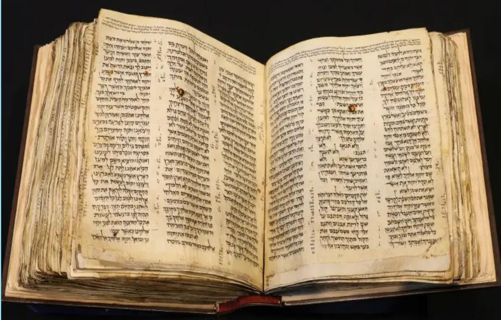
The Codex Sassoon manuscript is the world's oldest nearly complete copy of the Hebrew Bible. It was handwritten roughly 1,100 years ago on 792 pages of sheepskin, includes all 24 books of the Bible and is missing only about eight pages - $38.1M (Masoretic manuscript ~ 900AD)